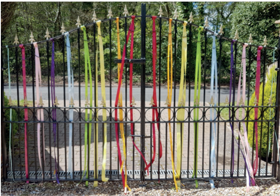
Rainbow ribbons for the NHS in Rushmoor