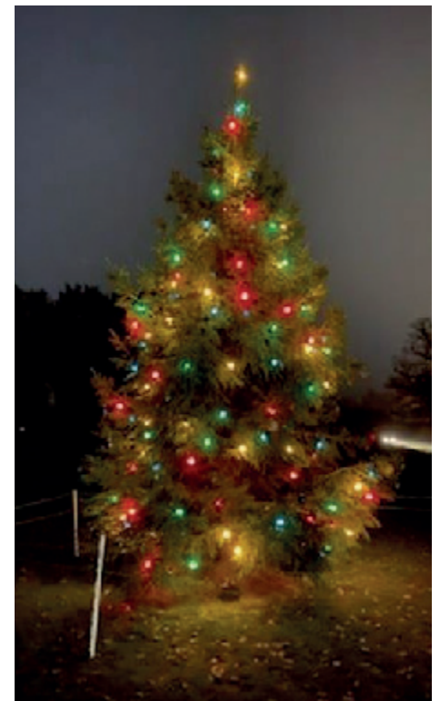
Tilford's Christmas tree bringing some light for 2020'